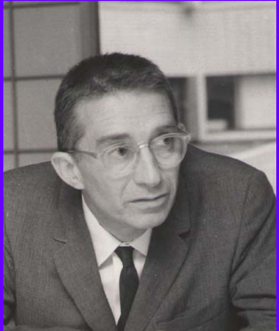
Walter Isard ~ 1960