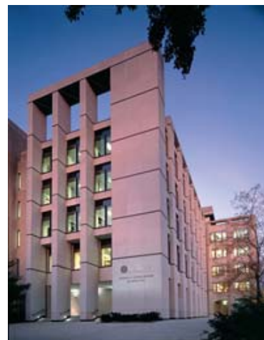
Donald P. Jacobs Center