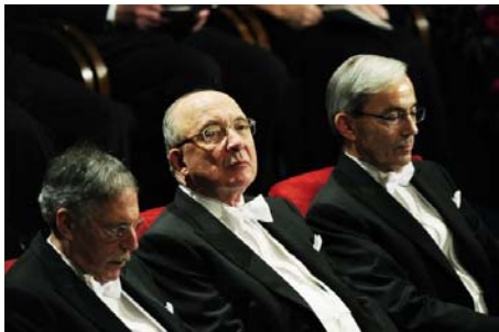
Peter Diamond, Dale Mortensen, and Christopher Pissarides