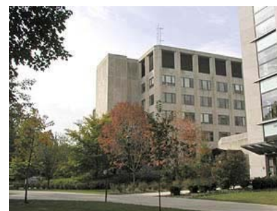
Donald P. Jacobs Center