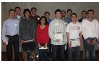
Distinguished Teaching Assistant Award Winners for 2010-2011